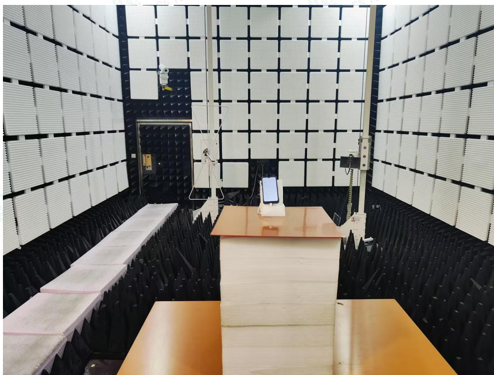
Spurious Emission Below 1GHz & Above 1GHz